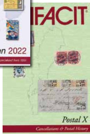
Facit Postal X The invaluable catalogue for collectors of Swedish town cancellations and postal history.