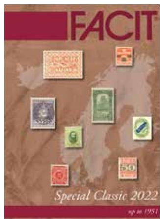
Facit Special Classic 2022 All Nordic stamps up to 1951 with varieties and specialities.

Always something new and affordable for your collection!