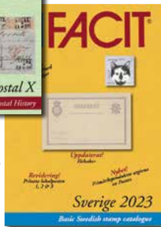
Facit Sverige 2023 The catalogue featuring all Swedish stamps in colour. Also Postal Stationery and Military Stationery.

FACIT FÖRLAGS AB Box 537, SE-201 25 Malmö, Sweden info@facit.se, www.facit.se