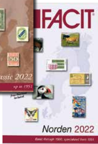
Facit Norden 2022 All Nordic stamps from 1951 onwards with varieties, the period before 1951 is described with issue and denomination, without varieties. Also complete list of booklets from all Nordic countries.