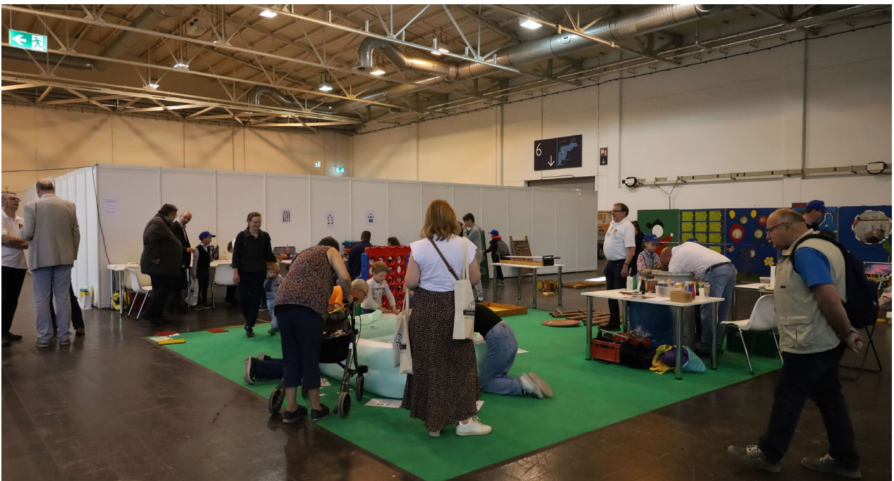
Stamp Pool for the young philatelists (photo courtesy of BDPH, Petra Kornmesser and Wilhelm van Loo).

For young collectors, there was a large area with games and activities. In the popular stamp pool, one could search for stamps from all over the world free of charge. Beginners were given a basic set of album, tweezers and stamps to start collecting.