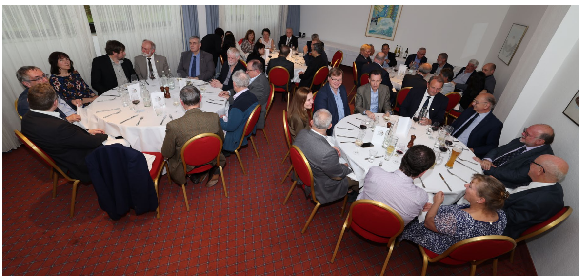
Jury Academy Class #8 Graduation Dinner on 23 May 2023.