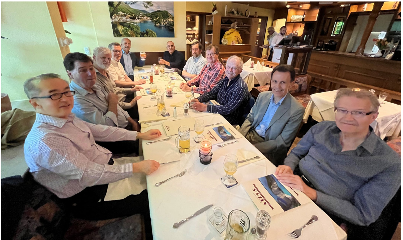
Trainees at Greek Restaurant after class.

The FIP Jury Academy class followed the scheme of the previous classes with only minor updates. On the first day the juror and team leader duties and responsibilities were discussed and the FIP regulations reviewed. The day ended with disclosing the titles of the exhibits to be evaluated the next day and some related material to be studied distributed. That evening the entire group enjoyed group hospitality at a local Greek restaurant. Aside from the great food, one class member hosted beverages. We thank both the FIP and local organizations for supporting the social activities.