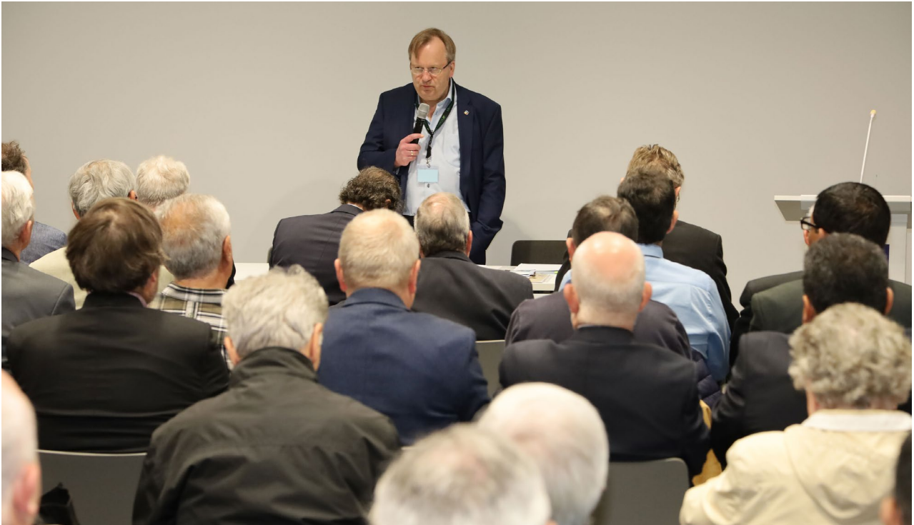
The Commissioner General for IBRA 2023 Mr Walter Bernatek briefing the National Commissioners in the Commissioners room.

The great interest in the 799 exhibited collections from 70 countries was striking. Rarely were so many visitors to be seen at the frames, studying the exhibits in detail, taking notes and photographing pages and pages. The desire to learn more about the hobby and the individual collecting field was also reflected in the almost 70 information stands of working and research communities, the generous reading and literature area as well as the advisory stands of the associations.