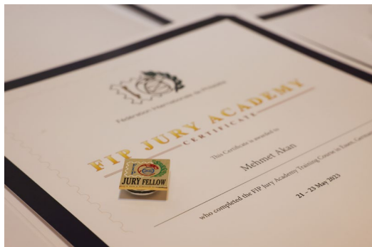
FIP Jury Fellow Certificate and Pin.