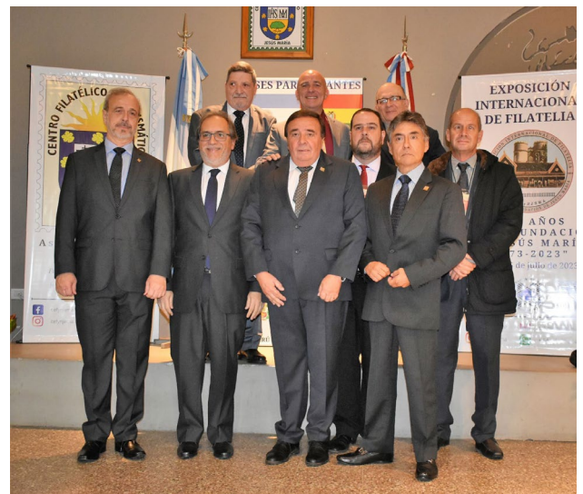
Commissioners (left photo) and jurors (right photo) for the exhibition.