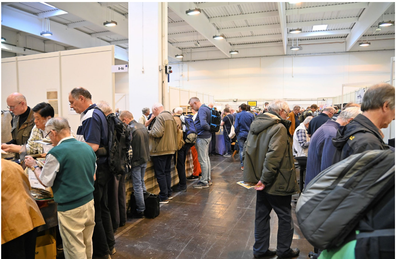
Huge crowd visiting the dealer booths daily.

A crowd puller was the treasure chamber with the unique Bordeaux letter with a Red and a Blue Mauritius, at which there were waiting times. Legends of German philately were also on display there, such as the letter with the Baden misprint, the unique first day cover with the “Black One”, the first German stamp, the only existing complete sheet of the “3 Pf. Saxony” (1850) or two “Hepburn” stamps, the most expensive modern stamp in the world. The small exhibition of the Germania definitive series from 1900 with unique designs and proofs also attracted visitors.