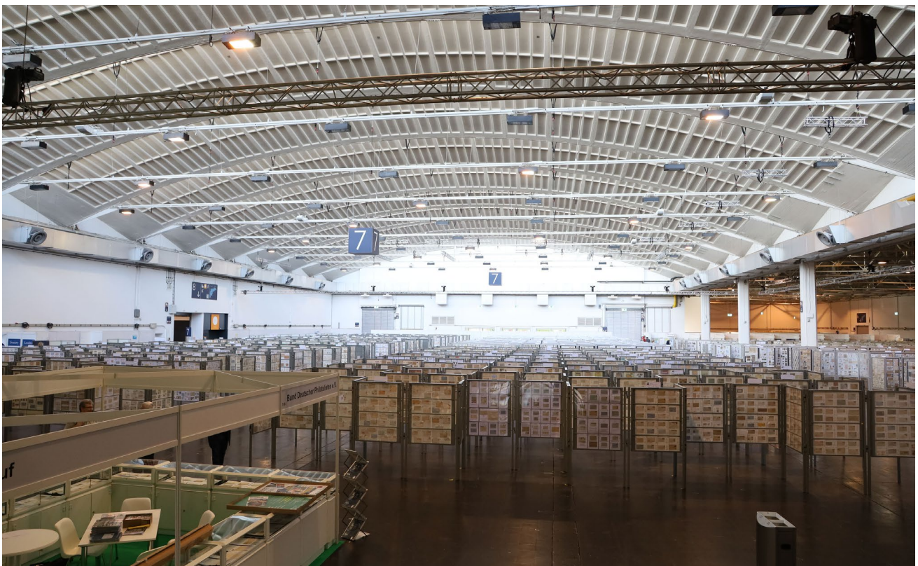
The exhibition hall with 3,600 frames (photo courtesy of BDPH, Petra Kornmesser and Wilhelm van Loo).

Turnover clearly exceeded expectations, and the suppliers were correspondingly euphoric. Classic and modern stamps were in demand, whether individually, in lots or in collections and part collections. The trend towards letters and other covers to enrich postal history and thematic collections was once again confirmed.