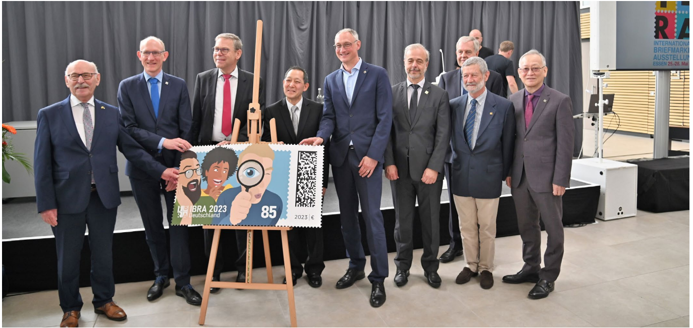
The Opening Ceremony of IBRA 2023 on 25 May 2023.